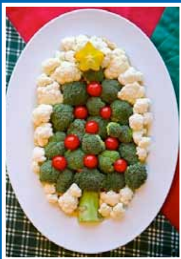
Christmas tree vegetable arrangement