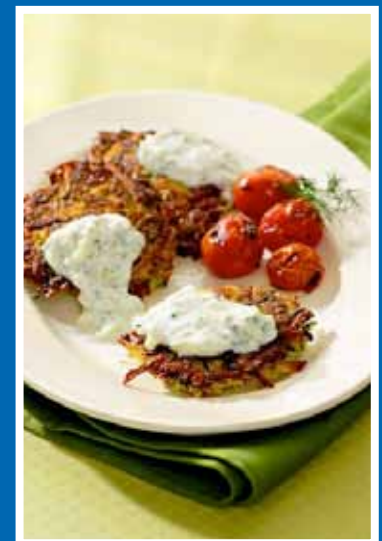
Zucchini-Potato Latkes with Tzatziki Recipe: http://www.eatingwell.com/recipes/zucchini_potato_latkes_with_tzatziki.html