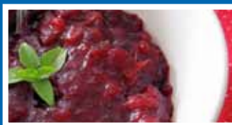
"Superfood" Basil Cranberry Sauce Recipe: http://greatist.com/health/superfood-cranberries