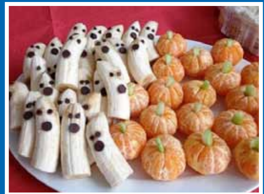
Halloween ghosts & pumpkins - simple treats using bananas, oranges, celery, and yes, a few chocolate chips

Do you have healthy holiday treat ideas, pictures, or recipes to share? Send them to publications@tasn.net and we'll include them in next year's issue!